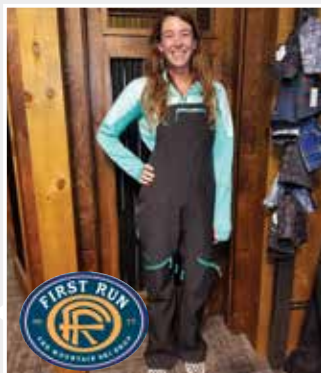
Fly Low Women's Foxy Bib Ski Pant Stretchy, waterproof & breathable fabric