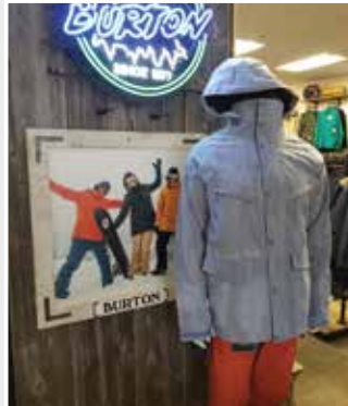
Men's Breach Jacket Intelligent warmth and eco-friendly