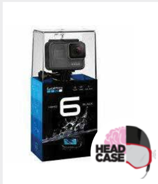
GoPro Hero 6 Capturing your highest-res memories yet!