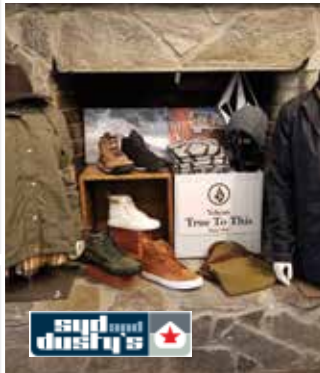
Vans Hi Sk8 Pro & Volcom 2018 Collection His & hers – Style on and off the hill