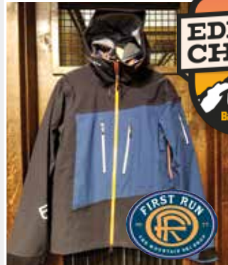
Ortovox Men's Guardian Shell Jacket Ideally equipped for any condition