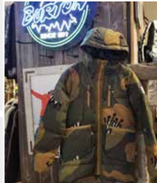
Women's King Pine Jacket Breakthrough premium performance