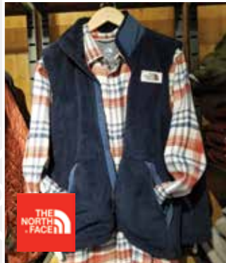
Men's Arroyo Flannel & Campshire Vest Layer it up in style