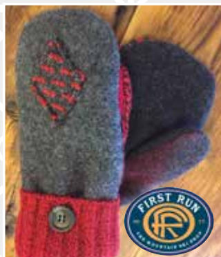
Crazy Mittens One-of-a-kind & eco-conscious