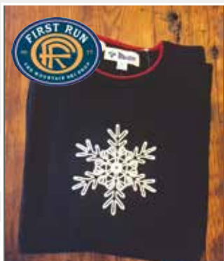
Meister Women's Noel Sweater Brimming with holiday spirit!