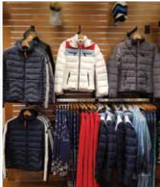
Ladies Winter 2018 Fire & Ice Collection Available at the Dashing Bear

From the latest in technical gear to sweet treats, you're sure to find something for everyone on your list. Our mountain experts weigh in on their must-have gear for staying warm and wintering like a pro.