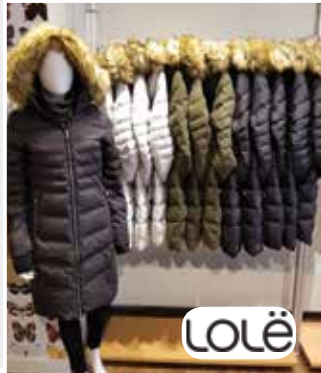
The Katie Parka Slim fitting with a 600 down insulation