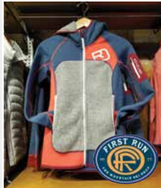
Ortovox Women's Fleece Plus Hoody Soft merino wool – Customer favorite!