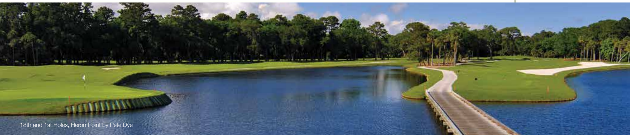
18th and 1st Holes, Heron Point by Pete Dye

Rules of the Road Bicyclists, joggers, walkers and rollerbladers share Sea Pines' leisure paths. To ensure that everyone enjoys our paths, here are a few helpful tips: • Stay in a single file on the right side of the path. • Use of the roadway, where a bike path exists, is prohibited by bicyclists, joggers, walkers & rollerbladers. • Be aware of motor vehicles. They are not required to stop for bicyclists. • Be considerate of pedestrians and warn them of your approach from at least 50 feet away. • Safety equipment, such as helmets and horns, is recommended for bicyclists. Helmets and kneepads are recommended for rollerbladers. • Obey all state and local traffic laws, including the use of hand signals and observance of traffic signs. • Guests who leave Sea Pines must obtain a pass code posted at the gate exits to gain re-admittance to the paths. • Please refrain from using the golf cart paths. • Racing or high-speed operation of bikes or rollerblades is prohibited. • Night biking is dangerous and not recommended in Sea Pines. • If you must bike at night, hike lights are mandatory. • Feeding or harassing alligators is dangerous and illegal.