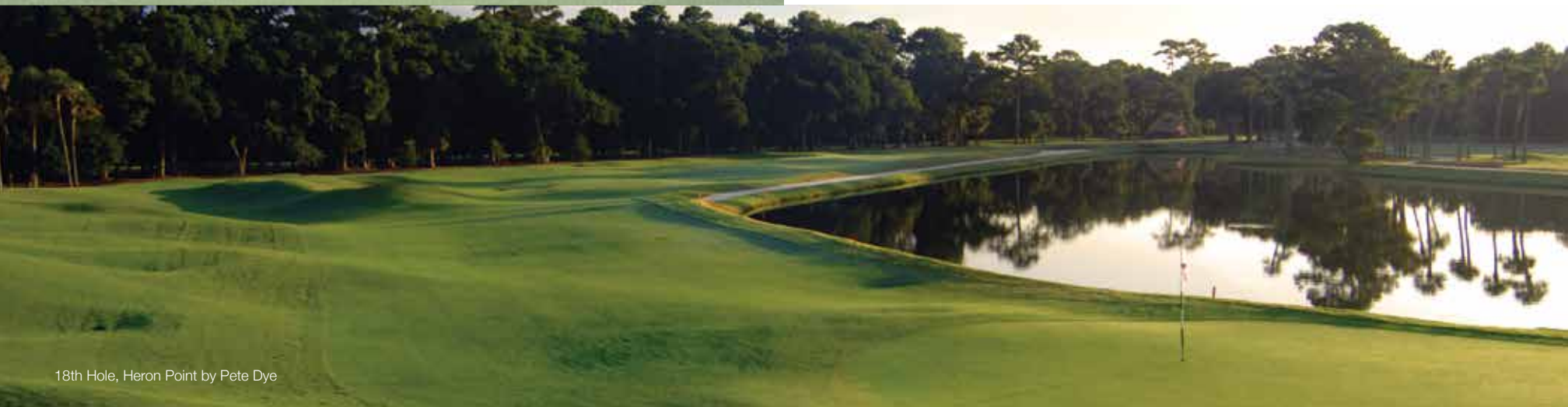
18th Hole, Heron Point by Pete Dye