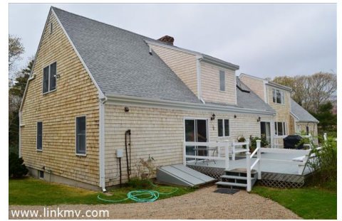
NEWLY CLEANED EXTERIOR!