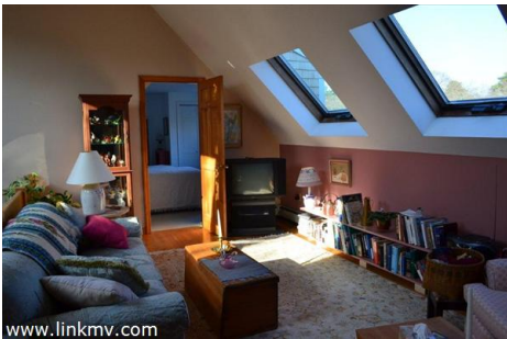
Wood floors in Loft/balcony!