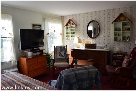
First Floor Mastersuite