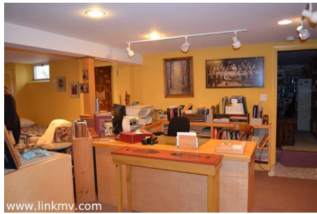
Custom built in office