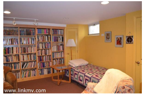
Beautiful custom built ins