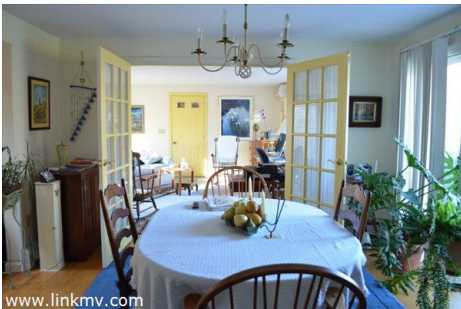
Dining w/French Doors and sliders to deck