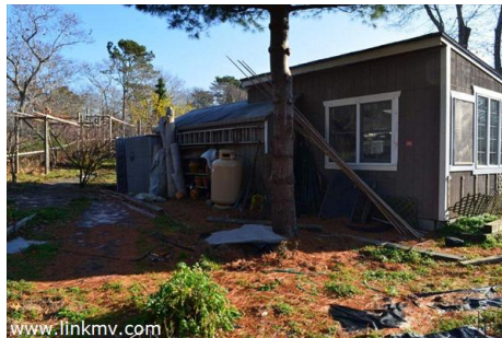
Exterior back of potting shed