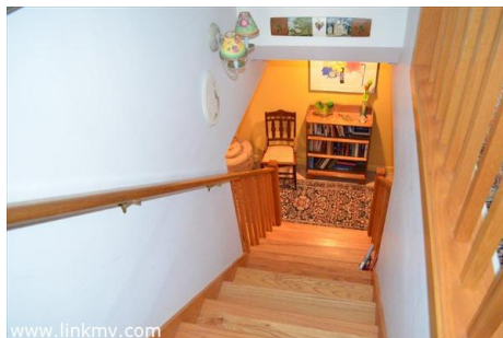
Wood stairway to finished basement