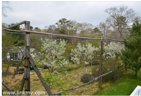
ORCHARD IN BLOOM!