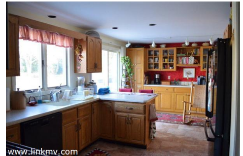
Designer Kitchen !