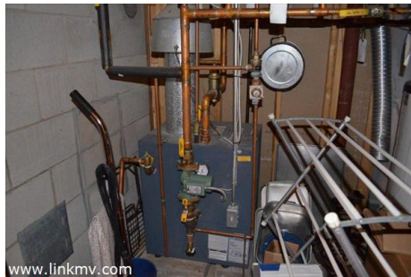
5 zone furnace