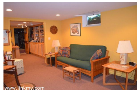
Finished living area !