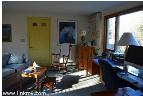
Sunfilled spacious home office!