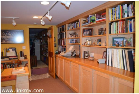
Library in basement