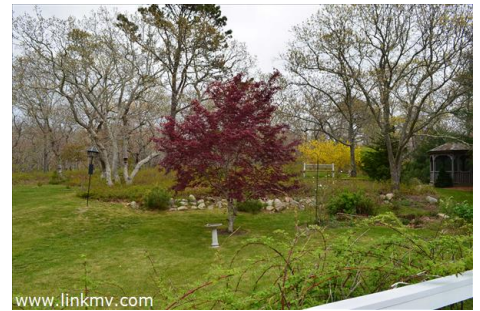
BEAUTIFUL BACK YARD!