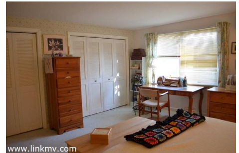
Plenty of Closets /Storage Space!