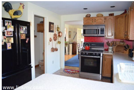
Electrolux Fridge, Bosch Stove