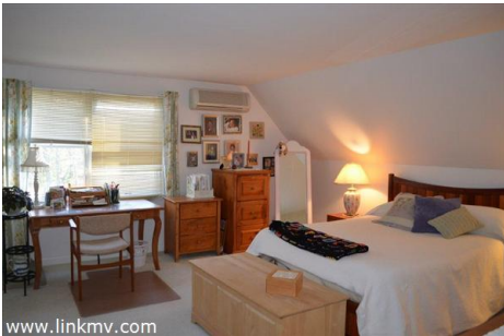
second floor master