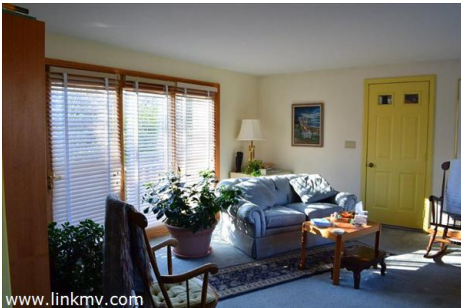
Home office view 3