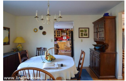
Dining view into Kitchen