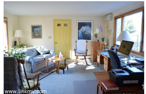
Enter 2 car garage and back yard