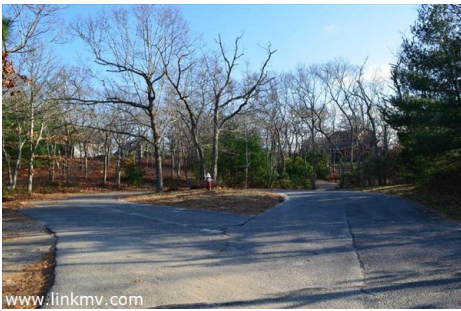
Private Cul De Sac