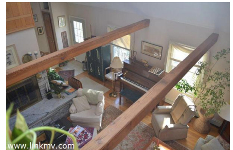
View from Loft !