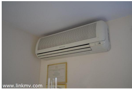
4 mini split bedrooms and office - AC/Heat