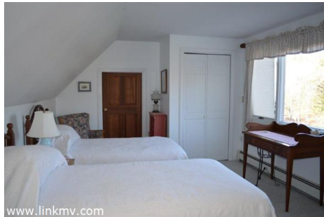
3rd Bedroom with huge storage closet