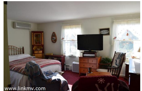
Spacious bright 1st flr Master with Mini Split AC & Heat

This information contained herein is believed to be reliable but is not guaranteed. Buyer note 2% Land Bank fee. Listings may be provided through broker reciprocity.