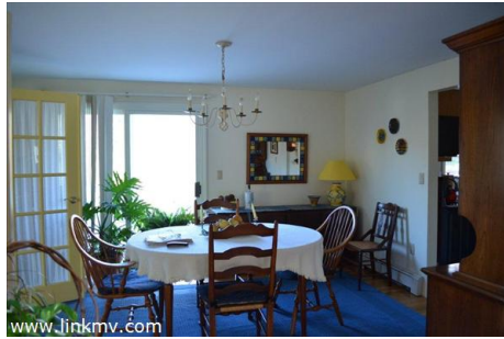
Spacious Dining w/Oak Wood Floors!