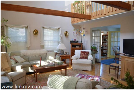
Sunfilled and great for entertaining!