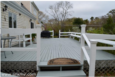
SPACIOUS EXTERIOR DECK!