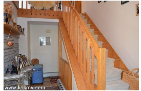
Stairway to second floor