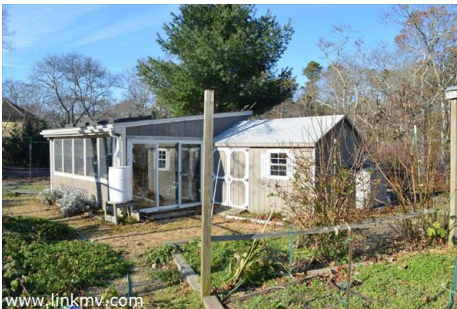
Greenhouse and potting shed