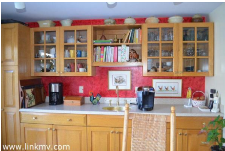
Coffee/wetbar- Corian Counter