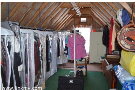
Storage Attic/closet potential?