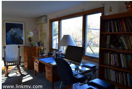
Mini Wall split Heat / AC