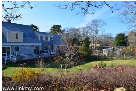
Exterior back of house