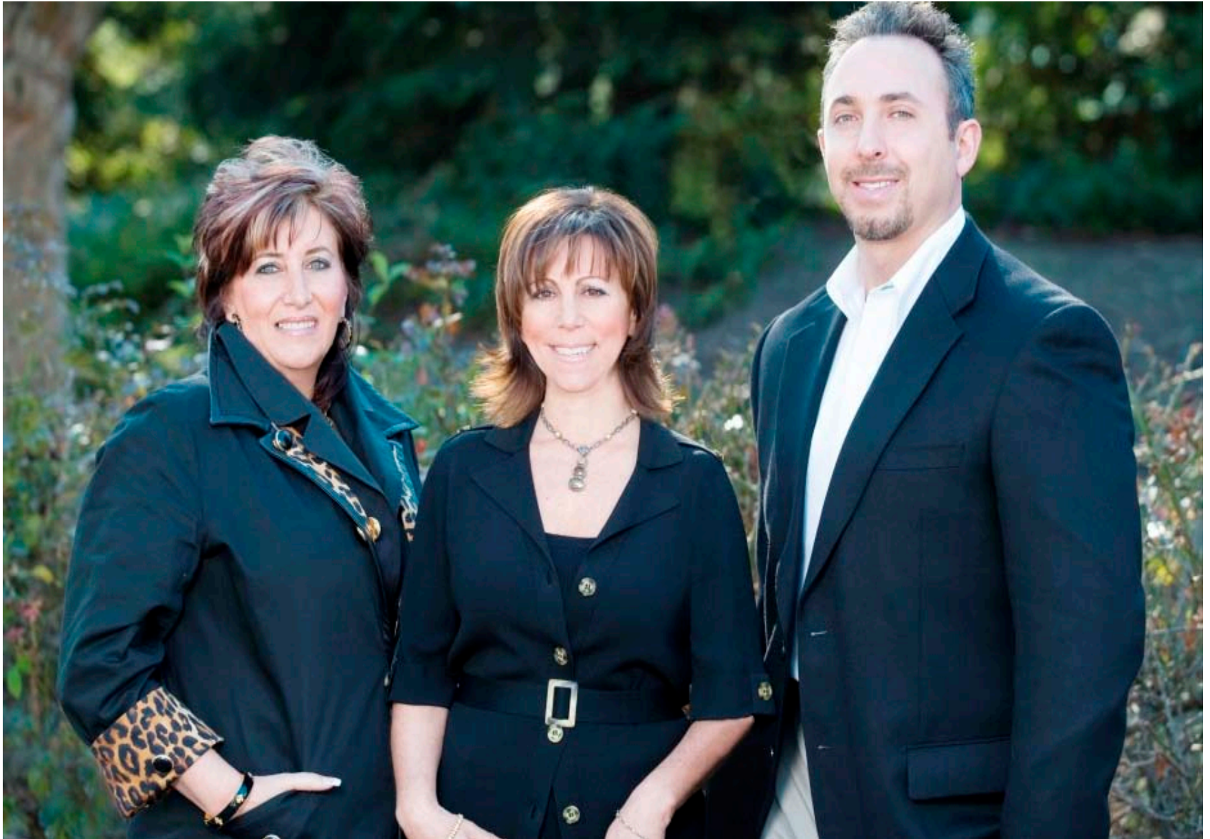
Integrity, Knowledge, Expertise...The LaHaye Team