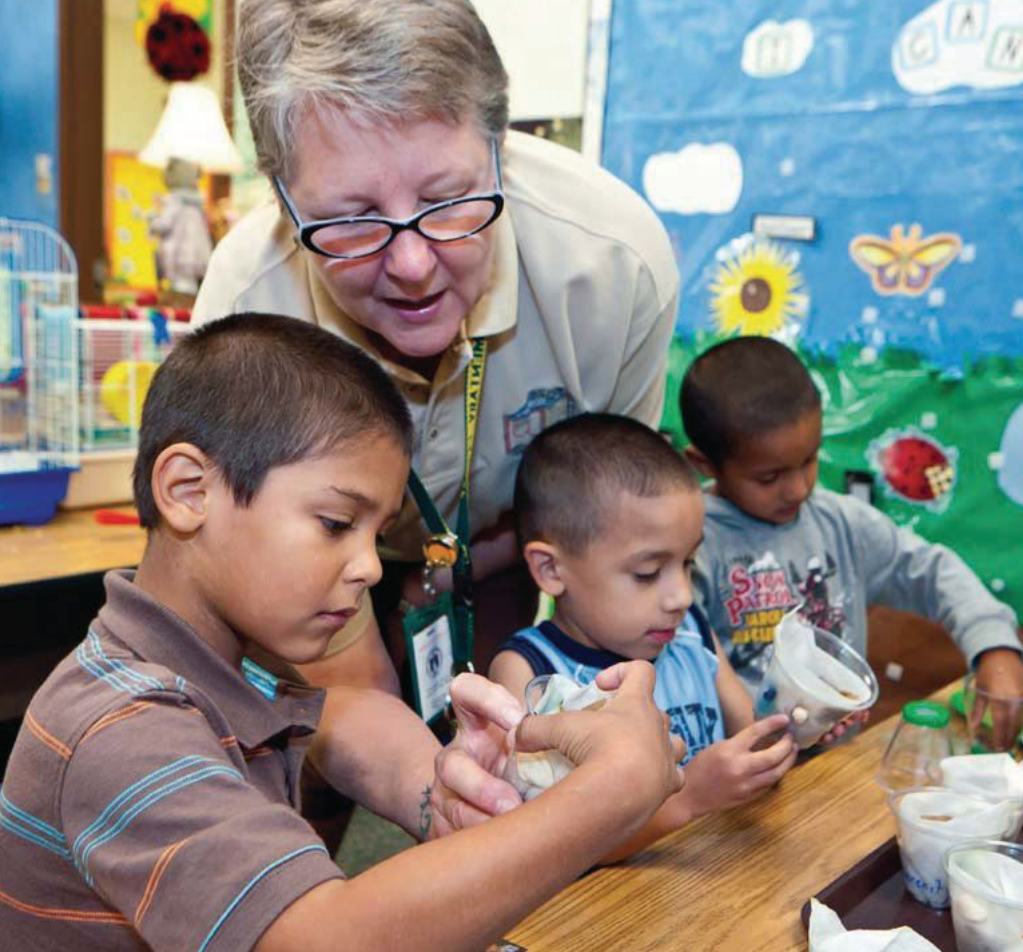
Students at Sanchez Elementary.

ity ratings. Its flagship college preparatory high school, Westlake High School, holds a national reputation for excellence, and is included on the nation's best high school lists by Newsweek and U.S. News & World Report . Westlake has award-winning, state- and nationally-recognized programs such as art, athletics, band, choir, orchestra, Destination Imagination, Future City Engineers, journalism, robotics, and a two-time national champion cheerleading program. Westlake students exceed state and national averages on ACT and SAT tests and consistently mark high numbers in the National Merit competition. Approximately 99 percent of Westlake High School's graduates continue their education in college with many matriculating to prestigious, world-class universities.