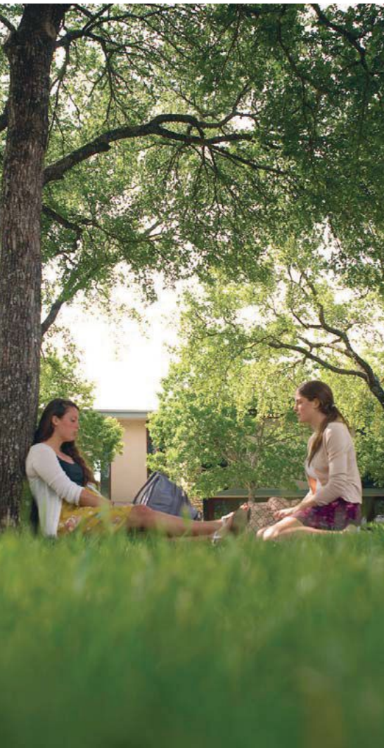
St. Stephen's Episcopal School