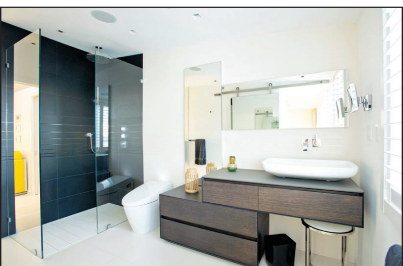
A one-of-a-kind custom bathroom on the first level is memorable and beautiful. It has a Branco Dolomite honed marble tile floor and shower surround plus crystal chiseled stone tile on the sink wall and a Kohler “Saile” commode. The Antonio Lupi “Splash” Corrian freestanding vanity has a Dornbracht “Mem” faucet as does the shower in the Kohler “Greek” tub.

One of the extra perks with this home is that several areas in the unit, including the master bathroom, are on an integrated sound system. Parking, guest parking, and even marina slips are available, too.