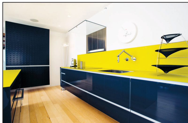
The Valcucine Ebony and Mustard Glass galley kitchen is equipped with state-of-the-art appliances

However, a custom wall-mounted LG AC/heating unit is efficient and can be decorative as well. This utilitarian element is designed to hold either a television or a static image.