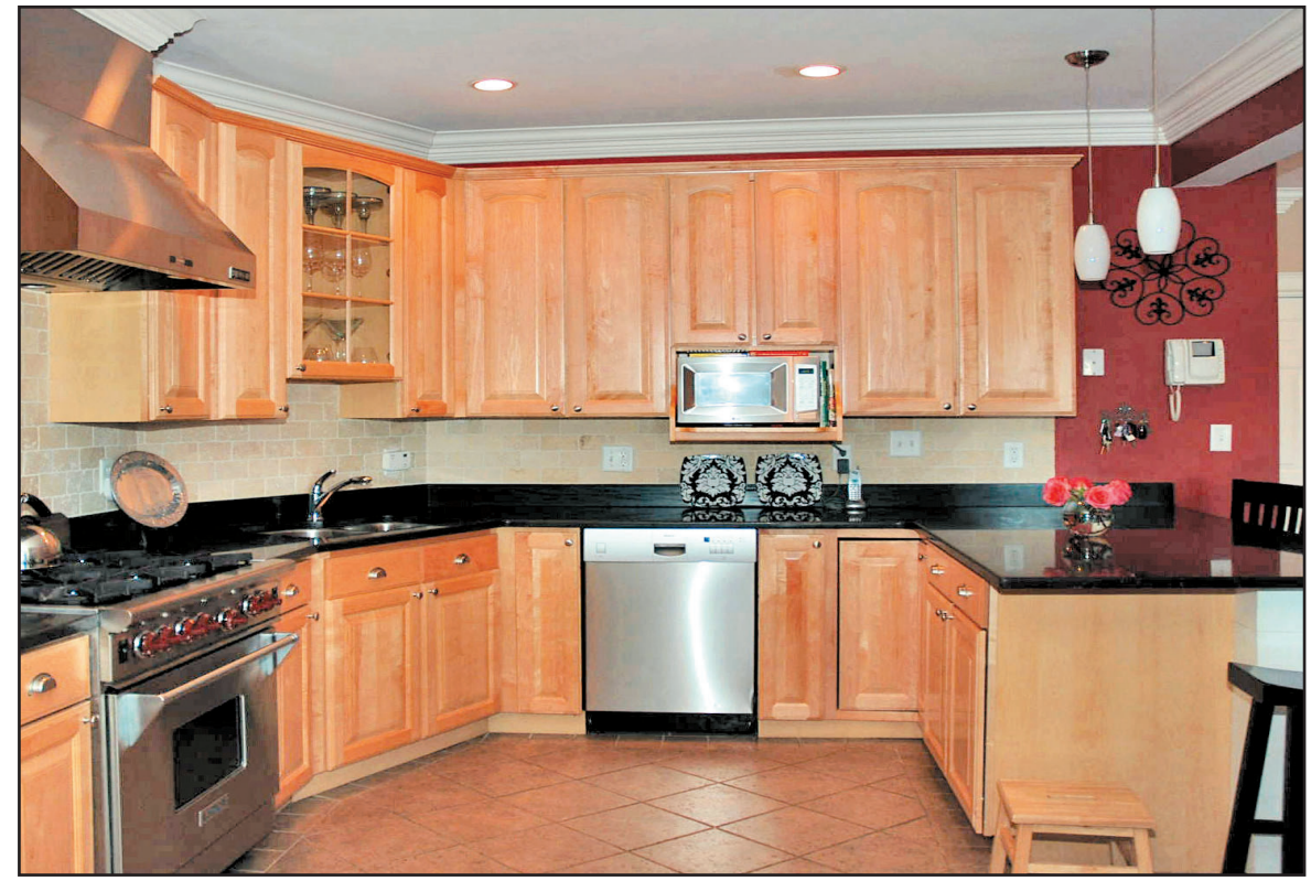
The kitchen features custom cabinets, honed black granite counters and sleek stainless steel appliances, including a six-burner gas range.

The kitchen is wonderful. Its floors are large squares of stone. The custom cabinets with specialty areas such as tray storage and lazy Susan corners are KCMA-certified