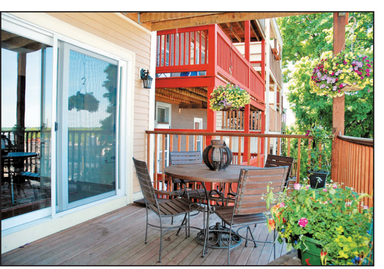
The duplex has lots of outdoor space. This is one of two decks, and there is a

The home has two zones of central heat and air conditioning, surround sound, a security system, plantation shutters and recessed lighting. The glistening hardwood floors are beautiful mahogany.