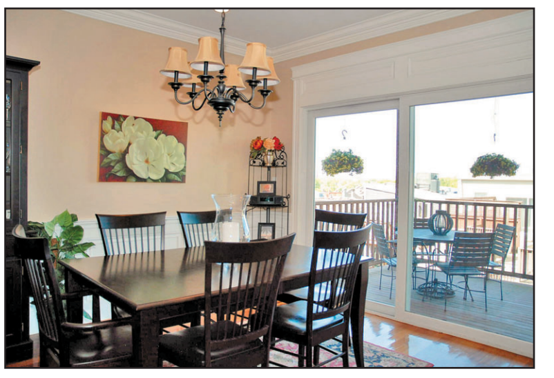
Glass sliders in the dining room open out to one of the decks.