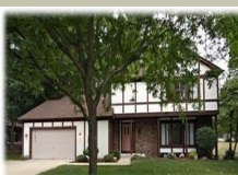
5183 Burning Tree 4 bedrooms / 2.5 baths