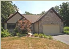
7983 Deerpath 3 bedrooms / 3 baths

DO YOU HAVE A FRIEND OR CO-WORKER LOOKING FOR A HOME? TELL THEM ABOUT THESE WONDERFUL RUDGATE HOMES CURRENTLY LISTED By SUE ROME