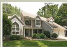
5750 Saddle Club 5 bedrooms / 3.5 baths