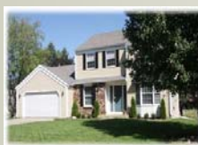
5382 Stoney Brook 4 bedrooms / 2.5 baths