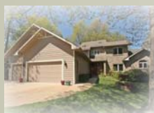
7936 Deerpath 3 bedrooms / 3 baths