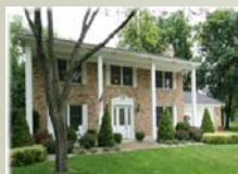
4757 Thrasher 4 bedrooms / 3 baths