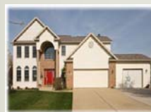
7141 Dorval 4 bedrooms / 2.5 baths